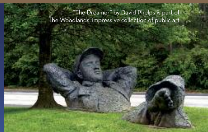
"The Dreamer" by David Phelps is part of The Woodlands' impressive collection of public art