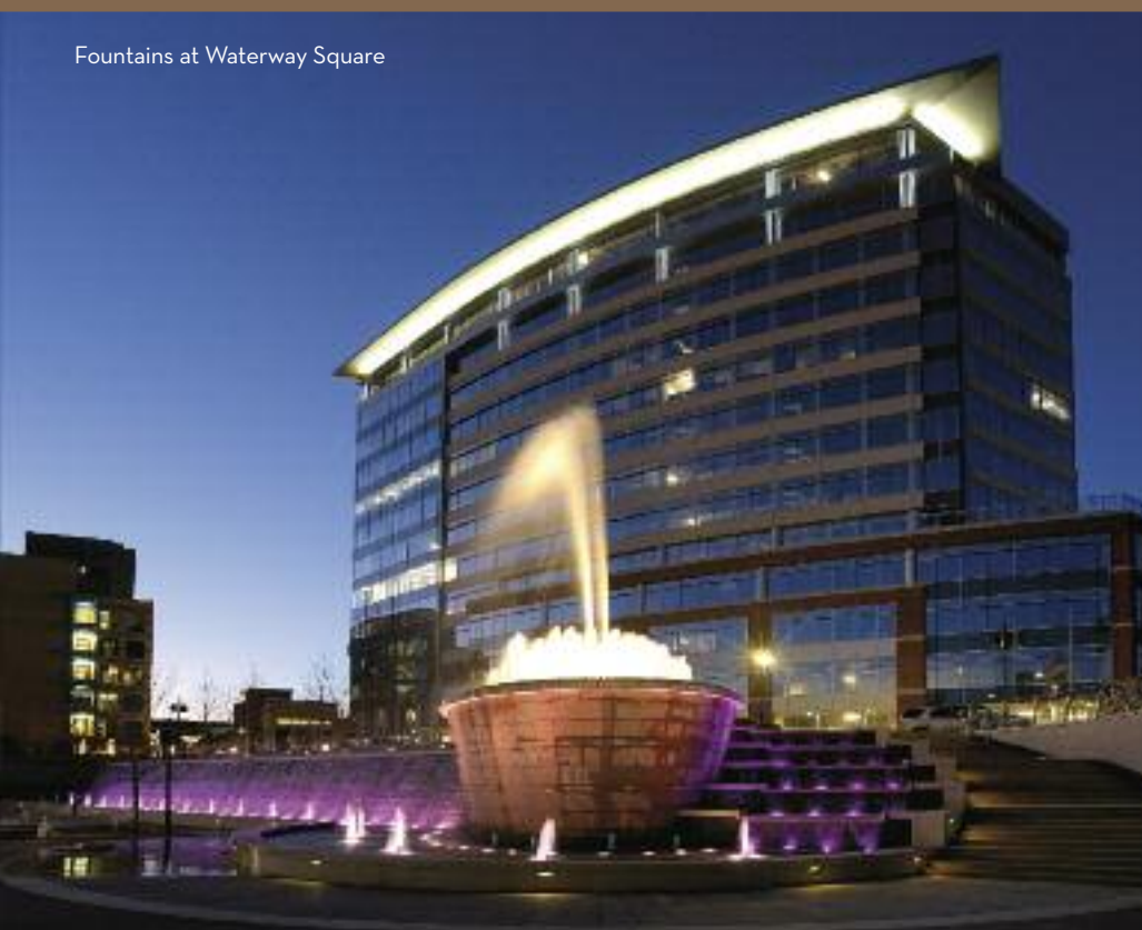
Fountains at Waterway Square

When it's time to step out, take the complimentary shuttle to The Woodlands Town Center just minutes away. You'll find award-winning restaurants, wine bars, live music and entertainment overlooking the twinkling lights of The Woodlands Waterway. Stroll through Market Street for one-of-a-kind boutiques, whimsical outdoor sculptures and concerts in the park.