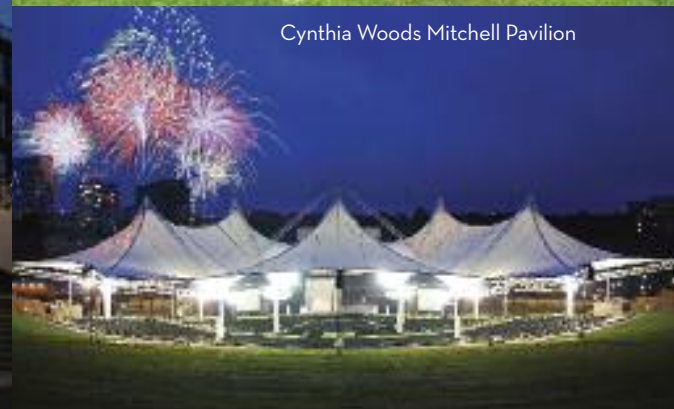
Cynthia Woods Mitchell Pavilion