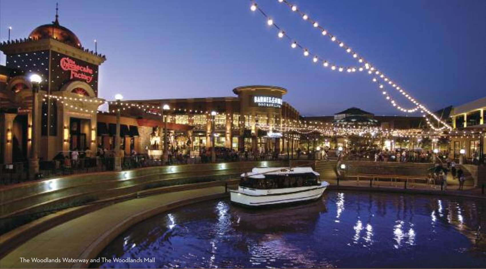
The Woodlands Waterway and The Woodlands Mall

When it's time to step out, take the complimentary shuttle to The Woodlands Town Center just minutes away. You'll find award-winning restaurants, wine bars, live music and entertainment overlooking the twinkling lights of The Woodlands Waterway. Stroll through Market Street for one-of-a-kind boutiques, whimsical outdoor sculptures and concerts in the park.