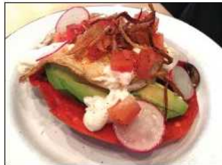
Nola's avocado tostada