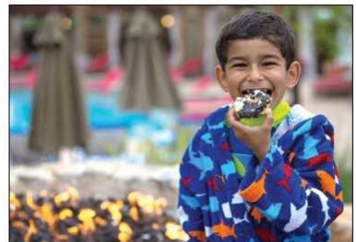
Kids and adults enjoy fireside s'mores.

At resorts in Central Texas and at the edge of the Piney Woods, new programs and packages give you plenty of one-stop-shopping options. Just north of Houston, The Woodlands Resort offers two seasonal specials: The Endless Summer Package and Kids Summer Splash start at under $300 and include credits to redeem and other bonus goodies. The 28,000 forested acres offer plenty of activity, too, from lawn games, dive-in movies and fireside s'mores to family tug-of-war games, bicycling in the woods, a lazy river winding through the woods and plenty of poolside adult drinks for parents. Ask also about golf packages, and check out the revamped steakhouse Robard's , noted for dry-aged beef and garden-to-glass cocktails. Details 800-433-2624, woodlandsresort.com. Your kitchen needn't be slime central, because the JW Marriott San Antonio Hill Country Resort & Spa opens its Slime Factory for kids this summer; guests choose favorite colors and ingredients to make all