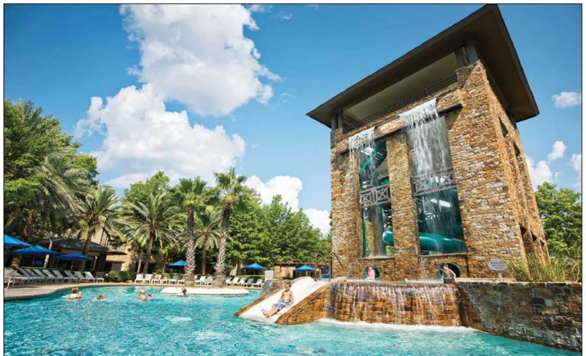
The double helix waterslide is one of the Woodlands Resort's splashy attractions.

Rivercenter , overlooking the famous river, offer attractive tricentennial packages. Among don't-miss newer dining possibilities are Nola Brunch & Beignets in a charming turquoise cottage three minutes from downtown (get the avocado tostada, Crescent City hash and, when on the menu, pecan-praline beignets), and star chef Jason Dady's new downtown offering, Range , with happy-hour goodies like manchego hushpuppies, a 44 Farms burger and raw oyster specials. Details sanantonio300.org and visitsanantonio.com/300.